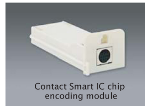
Contact Smart IC chip encoding module