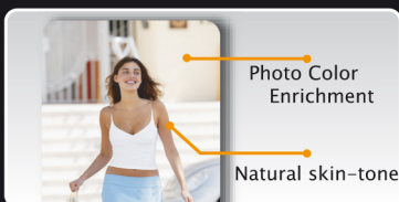
Photo Color Enrichment