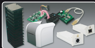
Photo Realistic Quality at Direct-to-Card Dye Sublimation Technology