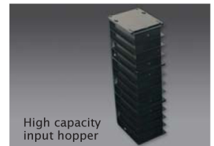
High capacity input hopper